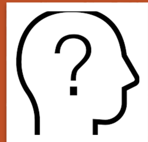
Thunder Bay Region: Position currently Open